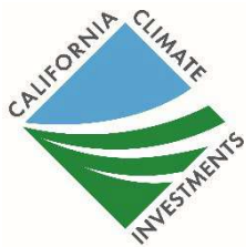
Figure 1: CCI logo

The CCI logo and name serves to bring under a single brand the many investments whose funding comes from the GGRF. The logo represents a consolidated and coordinated initiative by the State to address climate change by reducing greenhouse gases, while also investing in disadvantaged communities and achieving many other co-benefits.