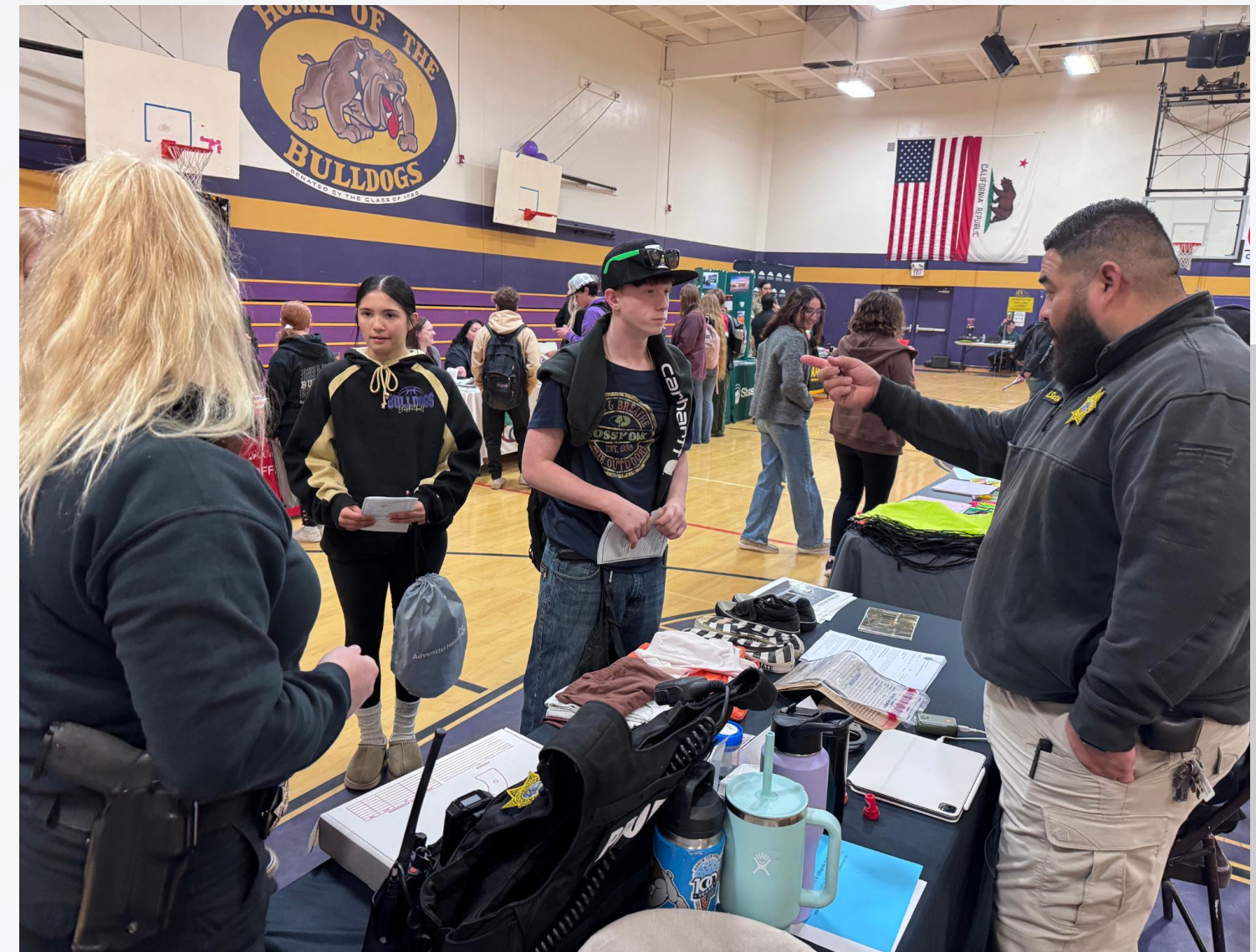
*Los Molinos Highschool Outreach Event*

As officers they have direct contact with the youth. They are trained to counsel with youth and implement evidence-based programs focused on the youth's growth and rehabilitation. They are trained experts, skilled in managing trauma and high-risk needs.