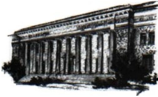
Tehama County Courthouse