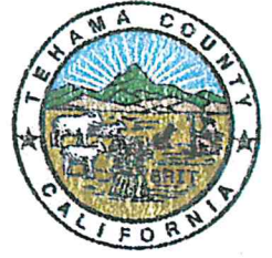
Exhibit A Code Enforcement Account Invoice

Tehama County Environmental Health Department 633 Washington Street, Room 36 Red Bluff, CA 96080 530-527-8020