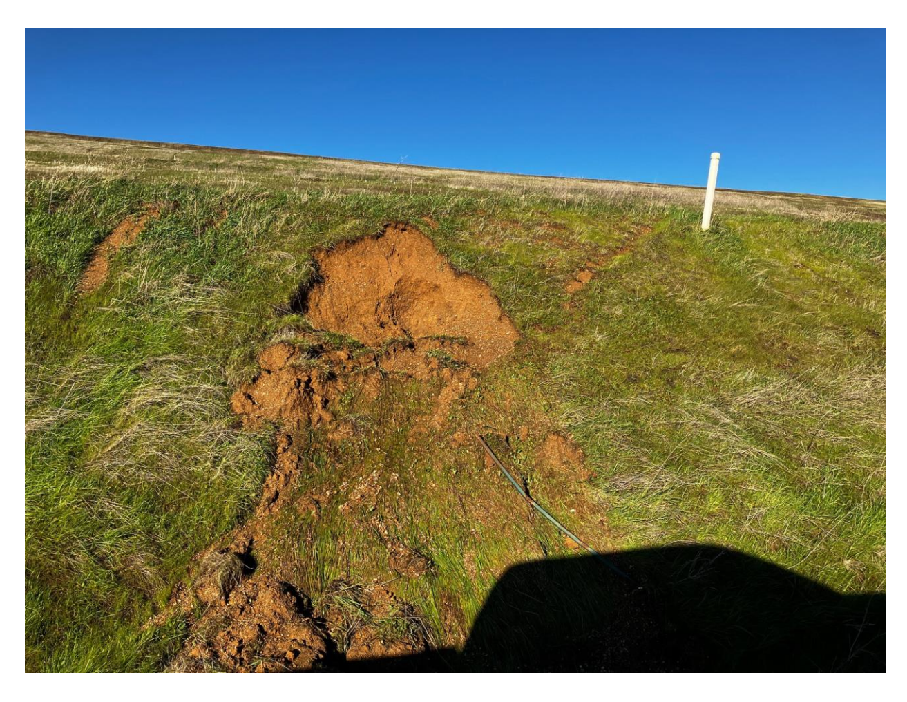
Figure 3: Phase I Southeast Slope erosion (Feb. 2025)