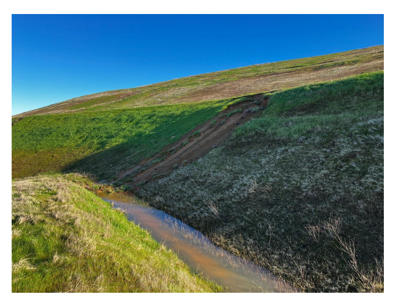
Figure 4: Phase I West Slope erosion (Feb. 2025)