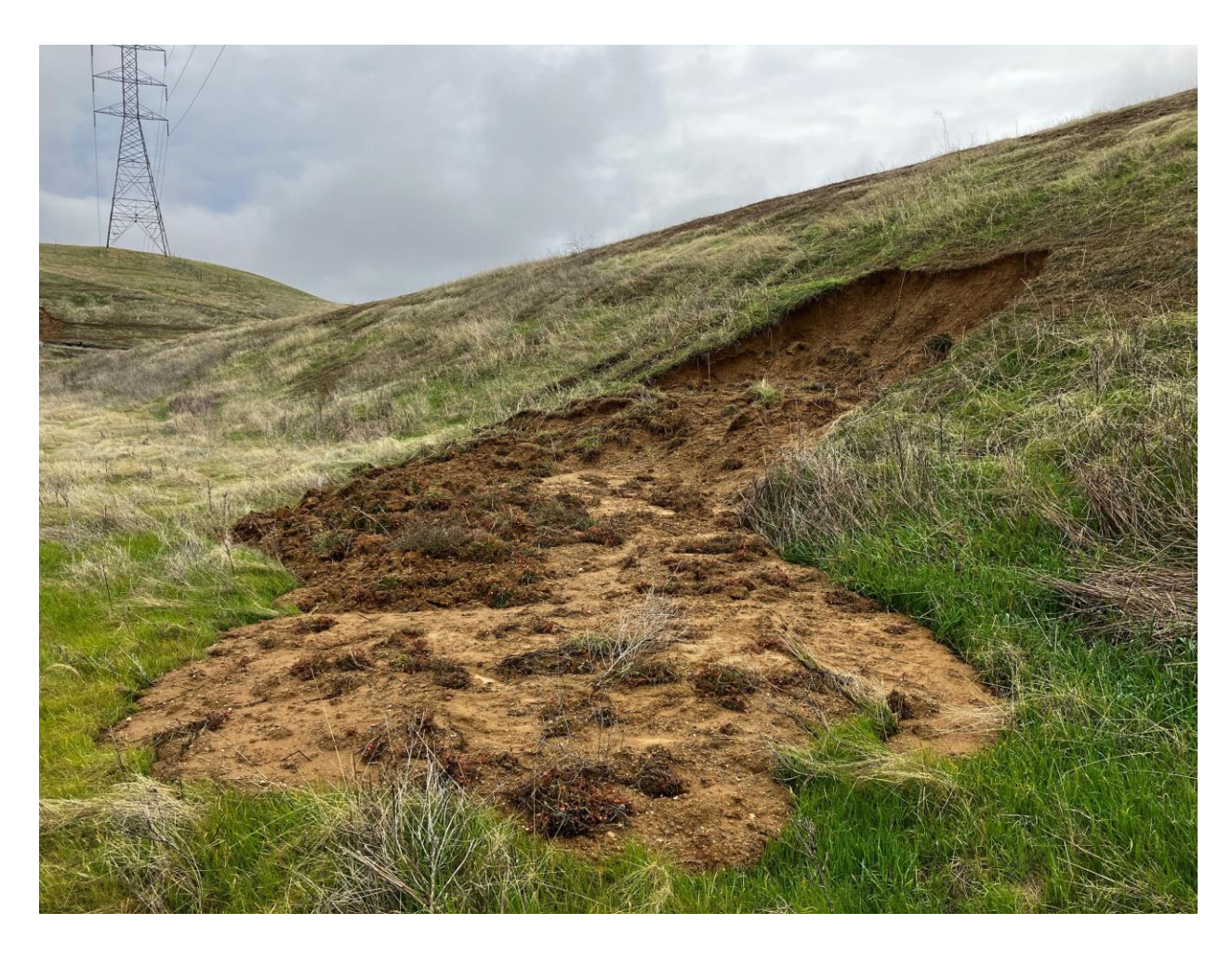
Figure 1: Phase I West Slope erosion (Dec. 2024)