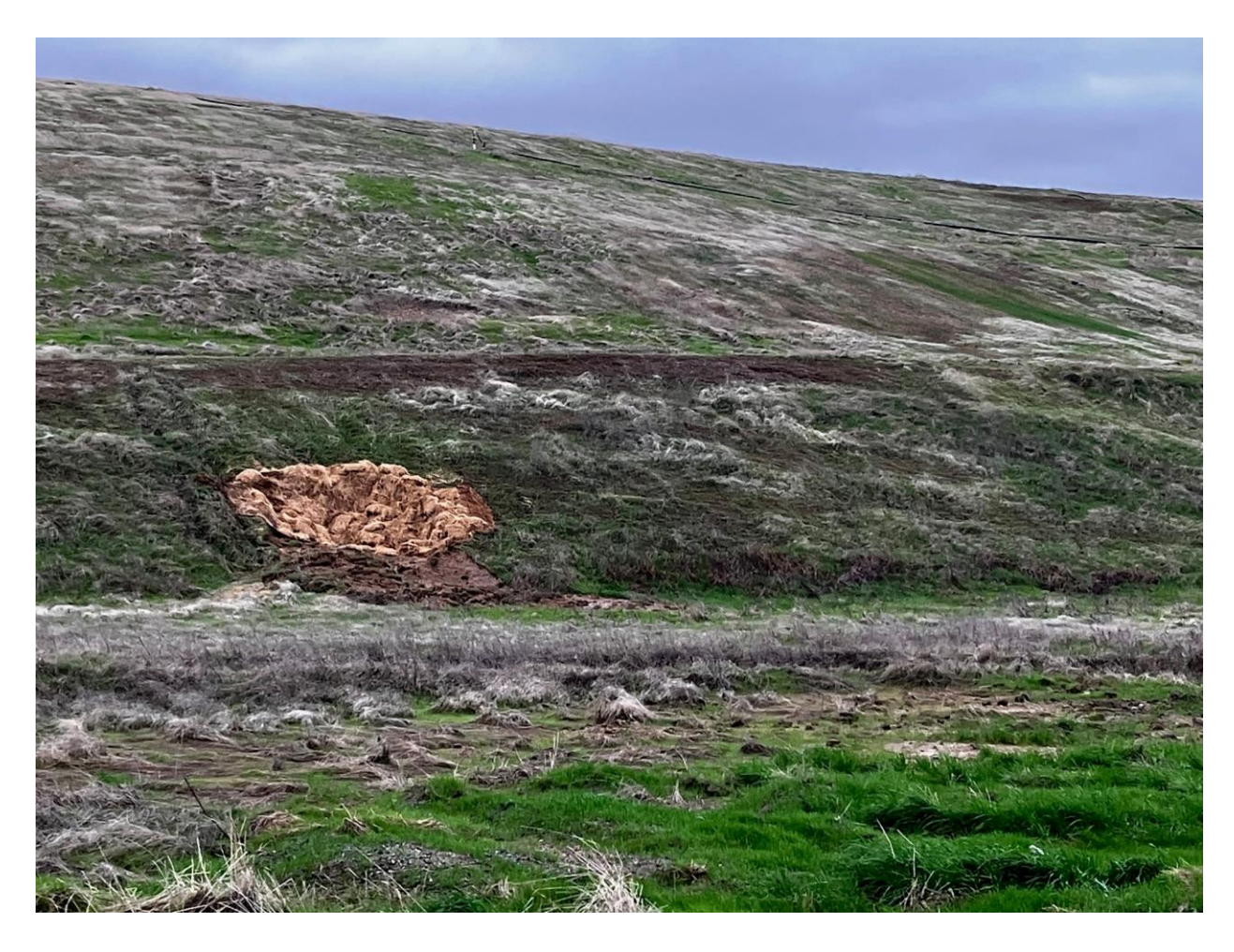
Figure 2: Phase 1 West Slope erosion w/ straw (Dec. 2024)