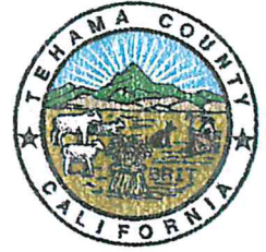
Exhibit A Code Enforcement Account Invoice

Tehama County Environmental Health Department 633 Washington Street, Room 36 Red Bluff, CA 96080 530-527-8020