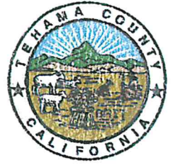
Exhibit A Code Enforcement Account Invoice

Tehama County Environmental Health Department 633 Washington Street, Room 36 Red Bluff, CA 96080 530-527-8020