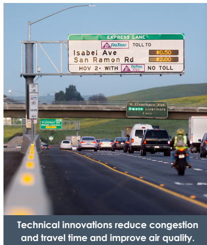
Technical innovations reduce congestion and travel time and improve air quality.