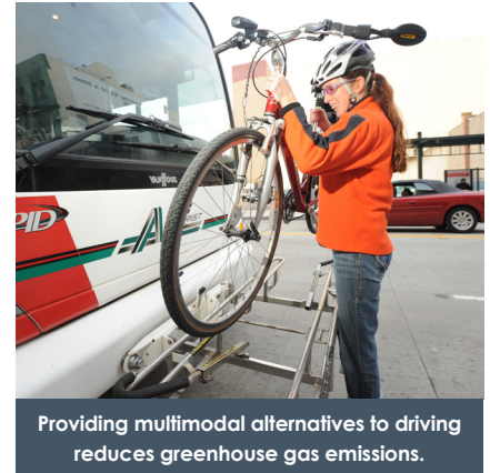
Providing multimodal alternatives to driving reduces greenhouse gas emissions.