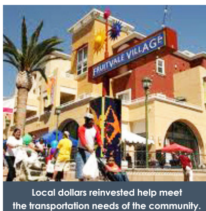
Local dollars reinvested help meet the transportation needs of the community.