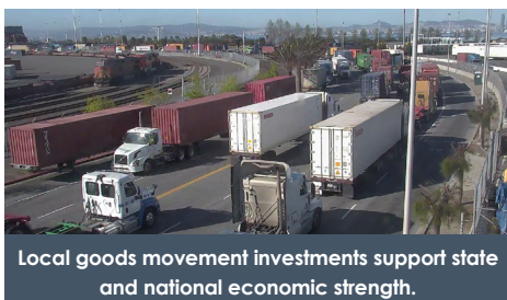
Local goods movement investments support state and national economic strength.